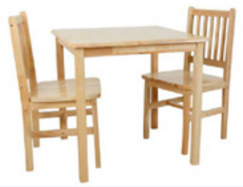
Table Dimensions: L: 92cm(open) / 50cm(closed) x W: 61 cm x H: 75cm Table Dimensions: L: 76cm x W: 76cm x H: 76cm