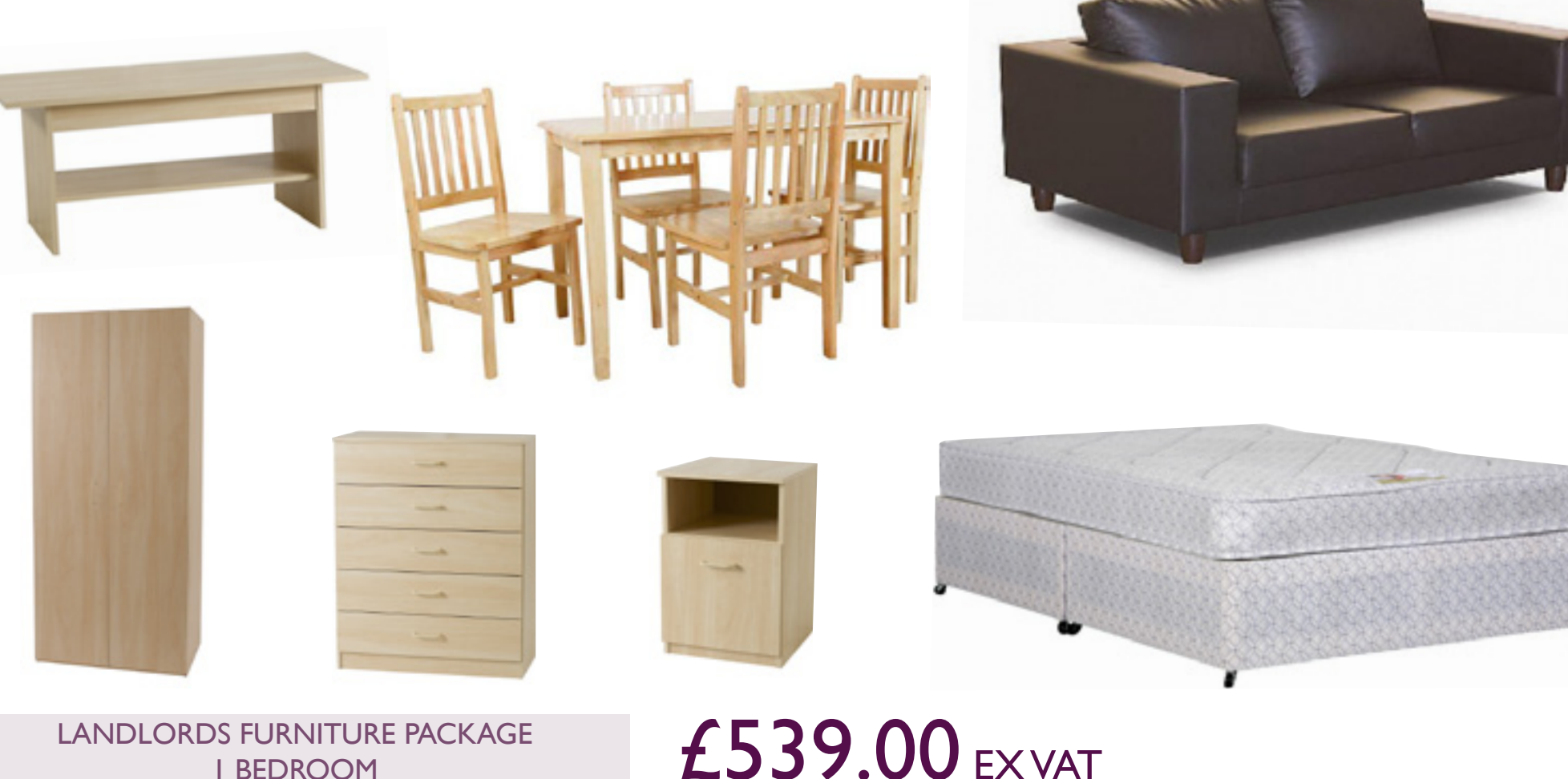
Table & 4 Chairs, Coffee Table, 3 Seater PVC Sofa, 2 Door Robe, 5 Draw Chest, Bedside Cabinet, Deep Quilted Double Divan Bed